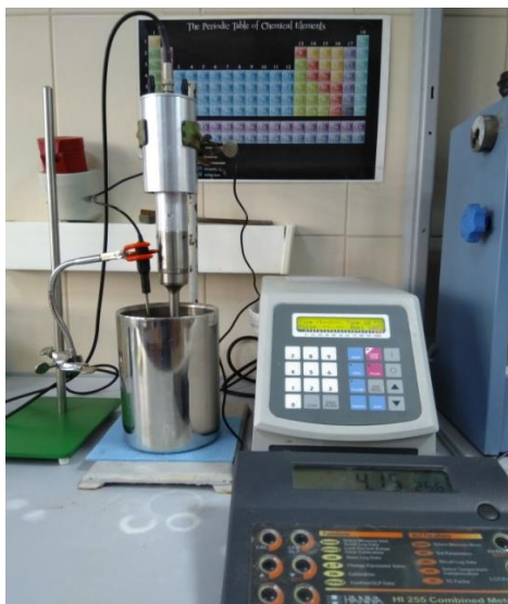
Fig. 1. Ultrasonic reactor

The main operational conditions for ultrasonic pretreatment were as following: